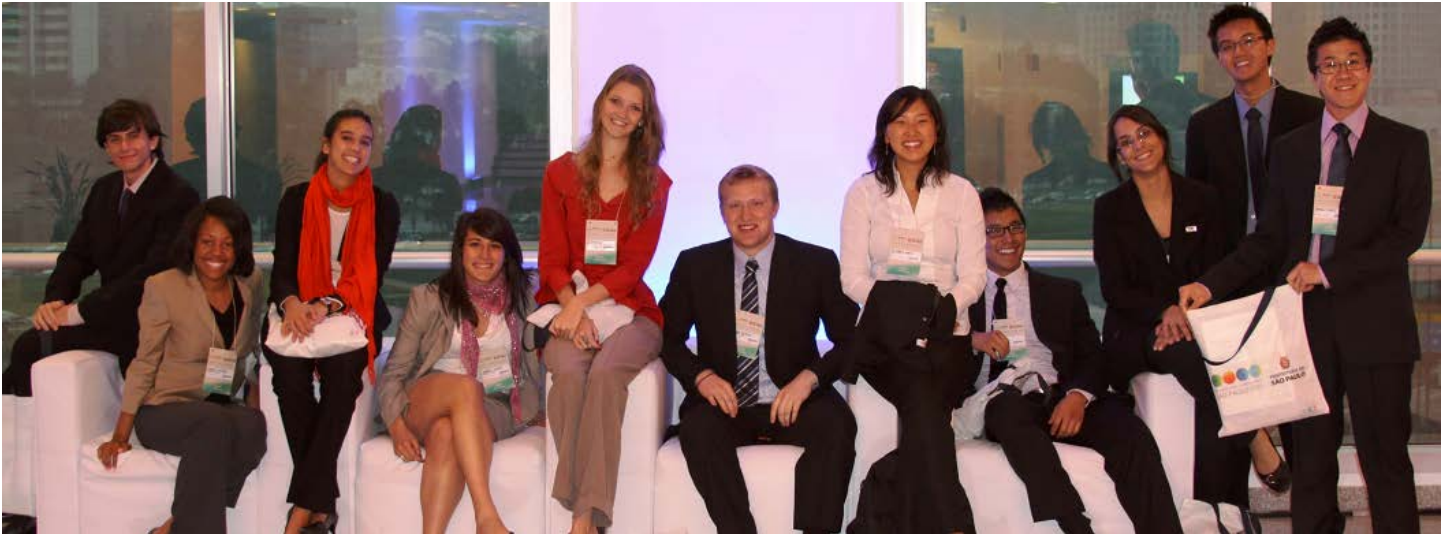
U of I students in Brazil for an international competition where they presented ideas on growth and sustainable development.